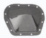
Ford Truck Differential Cover w/o Plug, Fits 9.5" Ring Gear WA9467 Chromed steel -12 Bolt

Note: These Pans Can Be Special Large Quantity Ordered In Aluminum