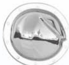
WA4786 GM Intermediate -10 Bolt