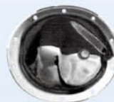
Chevy/GM Differential Cover w/ Plug (Fits 1964-72 Intermediate & 1967-72 Camaro K,G,C,B axles) WA9583 Chrome Steel - 10 Bolt