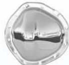
WA9070 GM Truck-12 Bolt