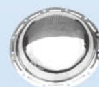
WA9119 Jeep 76-85 Corporate Rear-12 Bolt