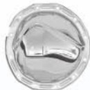
WA4787 GM Intermediate -12 Bolt