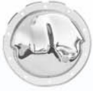
WA4135 GM88-up 1/2 Ton -10 Bolt