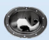
WA9589 All Chrysler w/ 8 1/4" Ring Gear Rear - 10 Bolt