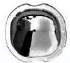
Gm Differential Cover w/ Filter Plug (Fits Intermediates) WA9538 Chromed steel -10 Bolt