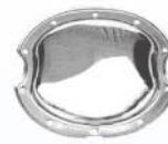
WA9190 GM 71-81-10 Bolt